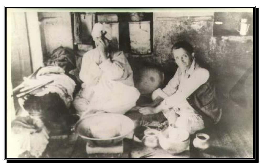
The author at the feet of the Master.