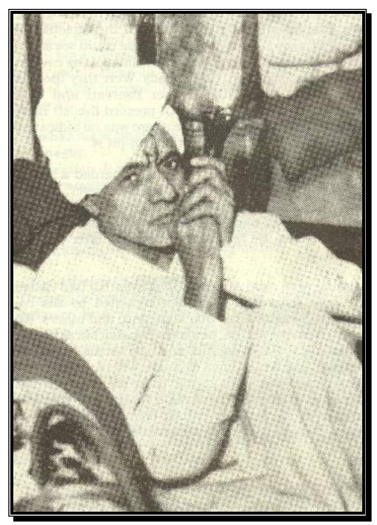
Bhagwaan Ji with the chillum .